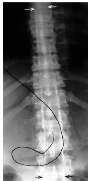
Figure 3. AP epidurogram, following a high block, with bilateral subdural columns of contrast from T4 to L4 (arrowed)

and is rarely investigated, an accurate diagnosis is not made.