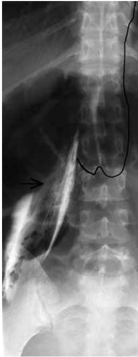
Figure 6. AP epidurogram following catheter escape through the right L2-3 intervertebral foramen, with contrast outlining the right psoas muscle (arrowed)