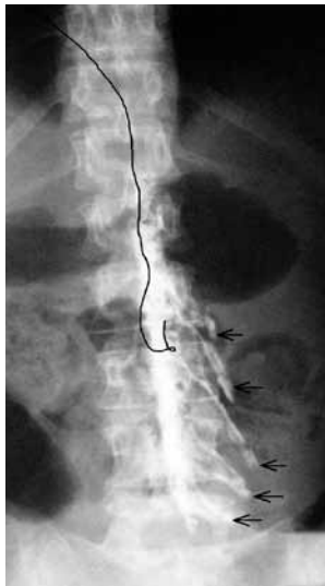
Figure 7. AP epidurogram with almost totally left-sided spread of contrast from L1 to L5 and profuse left foraminal spill (arrowed). Appearance suggestive of a midline septum