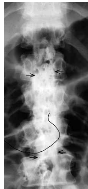
Figure 8. AP epidurogram showing a dense collection of contrast from L1 to L4 (arrowed), with characteristic scalloped edges and minimal foraminal spill, suggestive of a transverse septum

Where catheter escape is suspected, withdrawal of the catheter by 1-2 cm and injection of further LA will lead to a satisfactory block in about 50% of cases. In the remainder, the block is not improved, as the LA dose appears to follow the original path of the catheter out of the epidural space, as demonstrated by contrast injection and fluoroscopy.