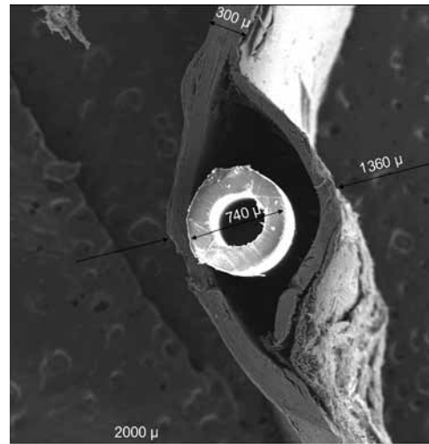
Figure 5. Scanning Electron Microscope Image of an epidural catheter within the dura (intradural) (x25) showing a dural thickness of 300 \mu\text{m} and a combined width of dura and catheter of 1360 \mu\text{m}

containing collagen fibres, allows for the suggestion that it is dural laminar detachment, or 'delamination', that is the major factor in the formation of intradural spaces [4] (Figure 5).