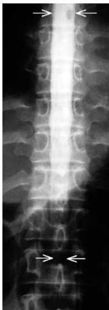
Figure 2. AP radiograph following 6 mL injection, with a mass of subarachnoid contrast extending from T7 to L2 (arrowed)

that fills most of the subarachnoid space, but is fairly featureless apart from some parallel 'linear streaking' representing the emerging nerve-roots. The absence of foraminal spill is obvious. The characteristic horizontal upper level of contrast may be seen in some cases, and this level may move with changes in patient position.