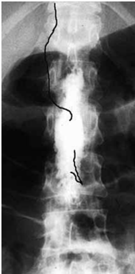
Figure 4. AP epidurogram of thoracolumbar spine showing dense 'sausage-shaped' mass of intradural contrast

swelling collection within the layers of the dura. This may cause transient pain and at least initially produces only a restricted neuraxial block. Repeated doses of local anaesthetic may escape retrogradely from the intradural space to the epidural space around the outside of the epidural catheter, eventually producing a clinically acceptable block. However, there is a slight risk of an extensive block developing some time later, following rupture of the remaining layers of dura and sometimes the arachnoid as well, leading to diversion of the intradural solution into the subdural or subarachnoid spaces [1]. Careful patient monitoring and repeated aspiration of the catheter for CSF are advised whenever several doses of local anaesthetic are required to correct an inadequate block.