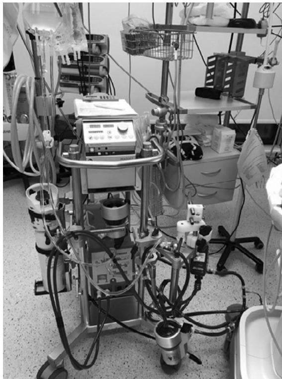
Figure 1. The extracorporeal membrane oxygenation machine

Following the procedure, the patient was in an extremely critical condition, on full ECMO support with infusions of adrenaline, noradrenaline, dopamine